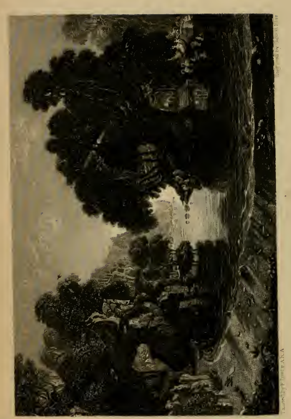
THE FAIRY ISLE.